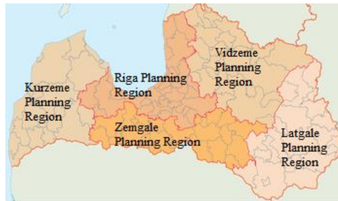
Fig. 2. Planning Regions of Latvia.

In the case of Latvia, the Planning Region Development Council formed the planning regions. The planning regions are Kurzeme Planning Region, Latgale Planning Region, Riga Planning Region, Vidzeme Planning Region and Zemgale Planning Region (see Fig. 2.) (Latvijas Vēstnesis 2004).