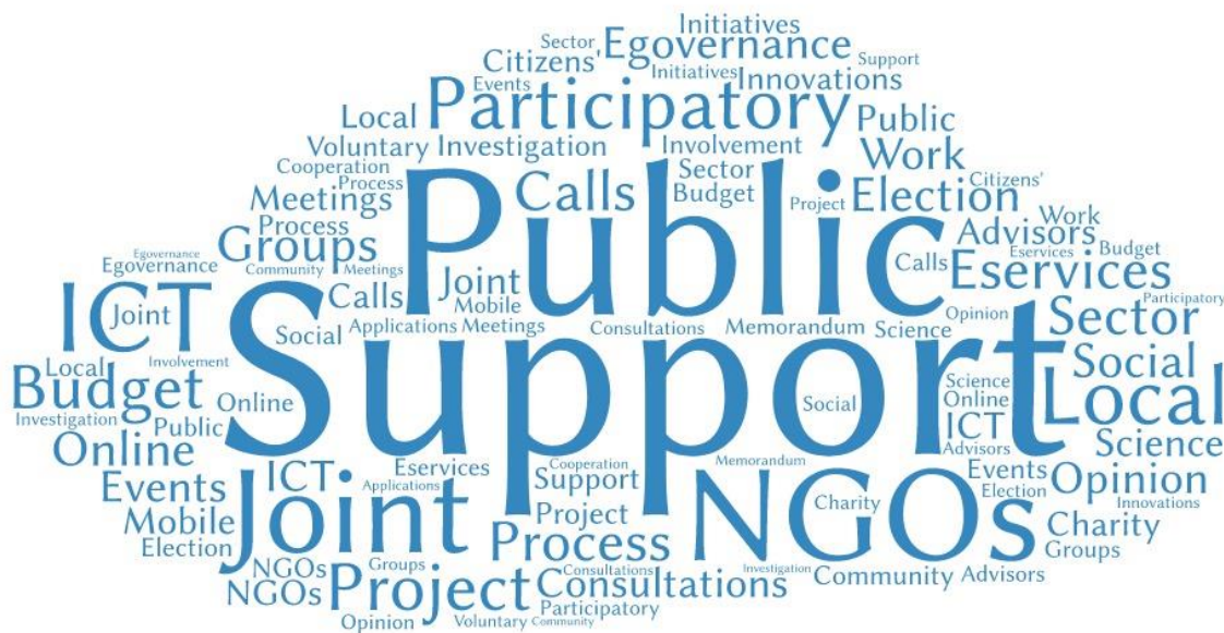
Fig. 3. Approaches of public institutions in Latvia in the participatory process.

for NGOs, organise project calls, set priorities for some municipal budget according to citizens' preferences (for culture). Many civic organisations also have developed platforms for regular communication with society (councils, local support groups, advisors, etc.).