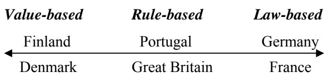
Figure 1: Basis of ethics management in countries

In Europe there are no pure examples of complex and comprehensive rules-based systems that we can see in the United States [13, p. 62] but Portugal and United Kingdom can be considered close to that.