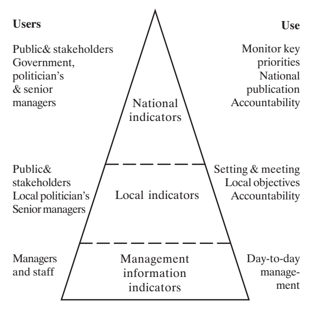
Figure 2. The different users and uses of indicators [1]

Each user of the performance measurement system therefore needs to be identified, and their information needs recognised (Figure 2).